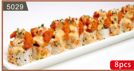
5029 ROCK SHRIMP TEMPURA 155.00 Spicy tuna California rolls laid flat, topped with rock shrimp Tempura, dressed with creamy mayo and sesame seeds.