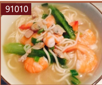
海鲜汤面 R188 海鲜大米粉 R188