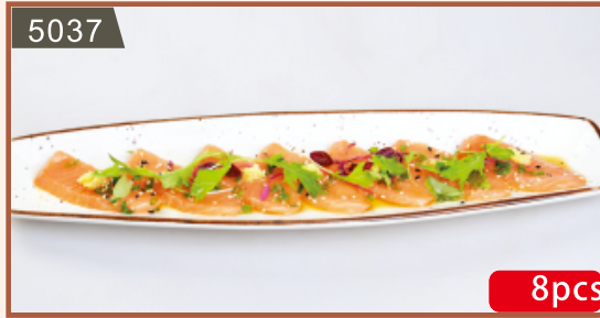
5037 NEW STYLE SASHIMI 148.00 Thinly sliced salmon sashimi, ginger, spring onion, toasted sesame seeds, soya sauce, ponzu, sesame oil