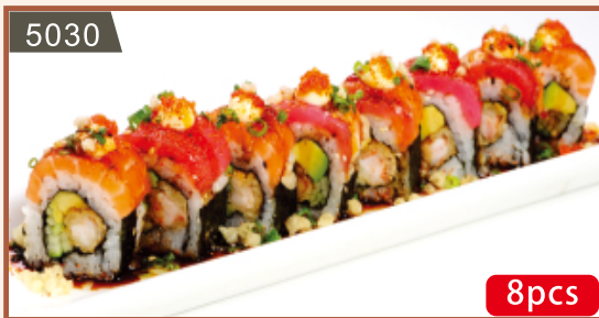
5030 RAINBOW or RAINBOW RELOADED 130.00 Salmon pr tempura prawn and avo cucumber on the inside. Salmon and tuna rainbow on the outside. Dressed with teriyaki, Sesame oil, Kewpie mayo, 7 spice, .