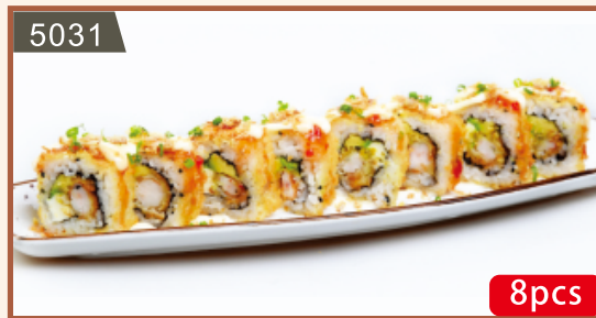
5031 FANTASTIC CRISPY ROLL 135.00 Crispy California rolls filled with salmon or tuna or tempura prawn with avo and cream cheese, topped with kewpie mayo, sweet chilli, and crispy shallots.