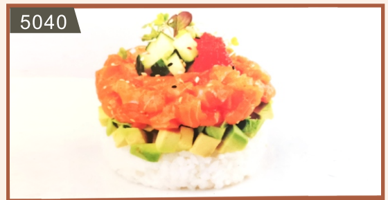
5040 CHIRASHI 155.00 Sushi rice, spicy salmon or tuna, avo, cucumber, caviar and sesame seeds.