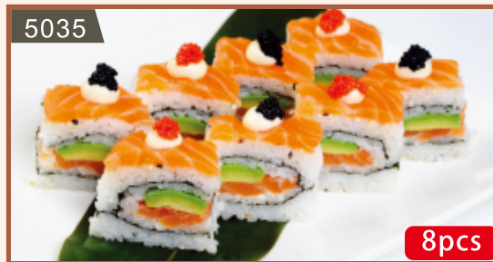
5035 SUPER FASHION SANDWICH 138.00 Salmon, avo fashion sandwich topped with salmon, mayonnaise and caviar.