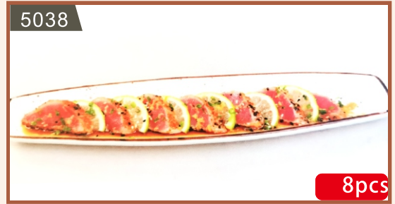
5038 TUNA TATAKI 135.00 Seared tuna sashimi, spring onion, toasted sesame seeds, tatak sauce, lemon slices, sesame oil