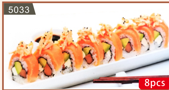
5033 PHILADELPHIA ROLL 158.00 Smoked salmon, cream cheese and avo inside, wrapped with smoked salmon topped with crab salad and sesame seeds.