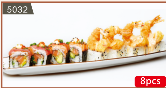
5032 4X4 NO.1 158.00 4 piece of salmon & tuna rainbow reloaded and 4 piece of spicy tuna California topped with creamy shrimp tempura.