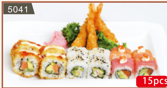
5041 THE SHUN DE PLATTER 228.00 4 fantastic crispy salmon rolls 4 prawn California rolls 4 salmon rainbow rolls 3 tempura prawns