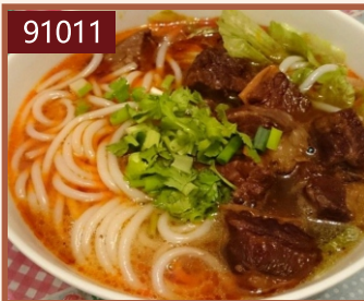
牛腩汤面 R168 牛腩大米粉 R168