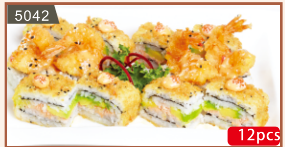
5042 YUMMY PLATTER 208.00 8 crispy salmon fashion sandwich 4 shrimp tempura on tuna California roll