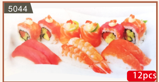
5044 ASSORTED PLATTER 238.00 4 salmon & tuna rainbow rolls 2 salmon roses 2 tuna nigiri 2 salmon nigiri 2 prawn nigiri