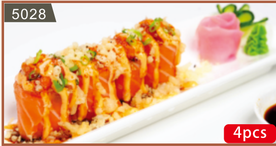
5028 SALMON GRENADE 135.00 Salmon roses filled with spicy salmon, dressed with chilli mayo and sweet soya sauce, topped with spring onion, 7-spice, sesame oil and tempura crunch.