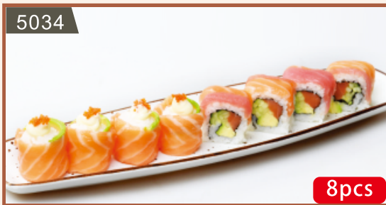
5034 4X4 NO.2 148.00 4 piece of salmon roses and 4 piece of salmon & tuna rainbow rolls