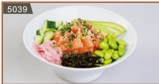
5039 SUSHI BOWL 150.00 Cubed salmon or tuna, avocado, edamame beans, sushi rice, cucumber, seaweed, spring onion, sesame oil, sesame seeds, soya sauce