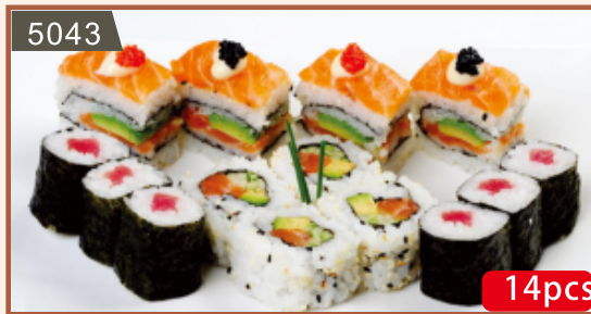
5043 COMBO PLATTER 158.00 4 salmon fashion sandwich 6 tuna maki rolls 4 salmon California rolls