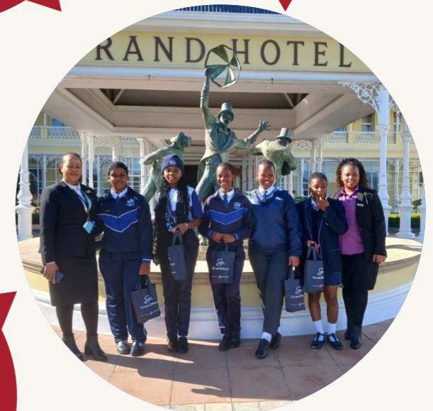
Hector Peterson High School learners spent a day at GrandWest

"Hard work pays off. If you fail to plan, you plan to fail."